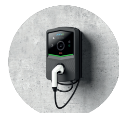
WALLBOX WALL MOUNTED

Not just intuitive, safe and convenient to use, I-CON is also easy to install and maintain; it is guaranteed for indoor and outdoor use and allows various installation scenarios.