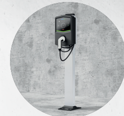
WALLBOX FLOOR-MOUNTED WITH SUPPORT