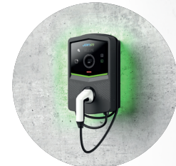
WALLBOX BACKLIGHT VERSION